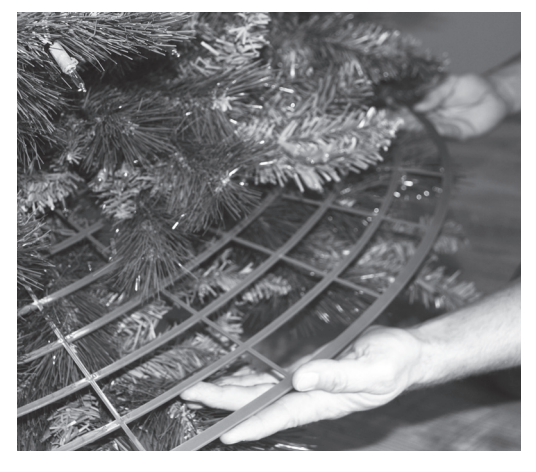
Step 2: Install the Christmas Tree Defender ™ in your tree at 18 to 24 inches off the floor (this is usually directly above the bottom row of branches). If your tree is already decorated you may want to remove ornaments in this area. Take the first piece with pegs pointed down and slide directly into the tree until you meet the trunk. Allow The Christmas Tree Defender ™ to rest on the branches below. Move any wires to the half circle indentions, created specifically to guide wires in and around the tree.

Step 8: Enjoy and capture Christmas memories with your family AND your pets! After the celebration of the holidays, unsnap and reuse. It's that easy!