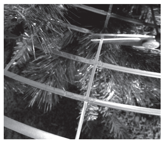
Step 6: (OPTIONAL) Now that your Christmas Tree Defender™ is in the tree, vou may trim any overhang for concealment by following the marked guide. The Christmas Tree Defender™ can be up to ten inches shorter than the above branches. Discard any additional loose pieces as they could cause choking, suffocation, or other hazards for children or pets.

Christmas Tree Defender™ is produced by Pet Guardian™ ... because we them.