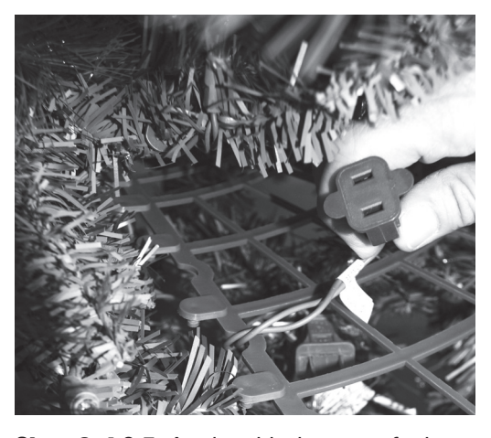
Steps 3, 4 & 5: Again with the pegs facing down insert the next piece of the Christmas Tree Defender™ into the tree aligning the first row of pegs with the peg holes on the second piece. Allow this second piece to rest on the branches and attach the aligned pegs into the peg holes. Again, if any wires are present, simply move them to the circle indentations, to guide them in and around the tree. Repeat this step two more times to complete the attachment of all four pieces.

If you have problems keeping your pets from digging in the soil of your potted plants, simply place the Christmas Tree Defender ™ around the bottom of the plant or tree and trim to fit your planter. This also works when planting flowers outside in large pots. Simply plant your flowers then lay the Christmas Tree Defender ™ on the rim working the flowers through the openings. As your spring flowers grow and bloom they will grow around the defender, giving your flowers support in strong winds and keeping animals from digging in the soil.